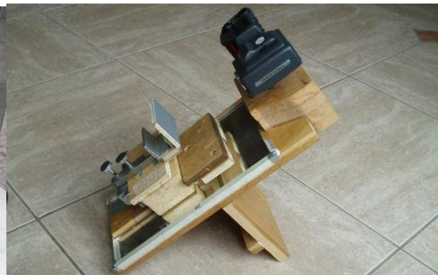
Final developed version of camera/specimen stage using a microscope two axis stage