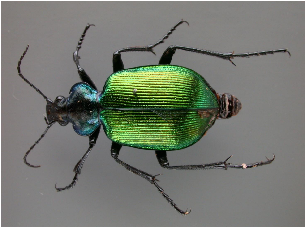
Fig 4. Male, Calosoma sycophanta . L.1758.( Coleoptera Carabidae ).

Close examination of Fig 3, shows a very satisfactory outcome with respect to overall modelling, pollination patterns, wing reticulation and shading, definition and depth of field. Fig 4 Metallics.