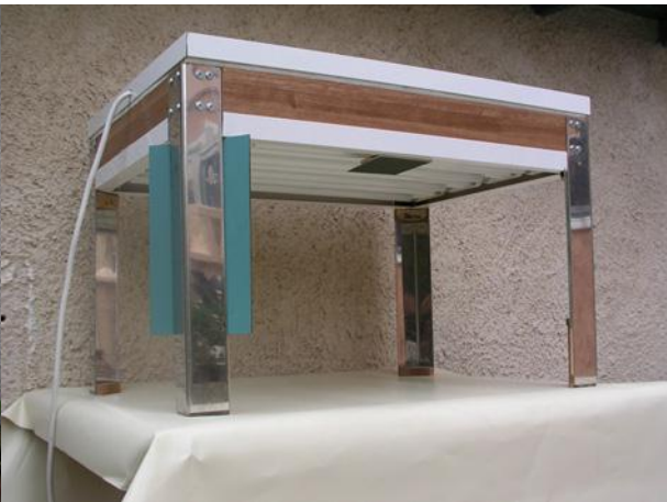
Light box and front left mirror in position right mirror removed