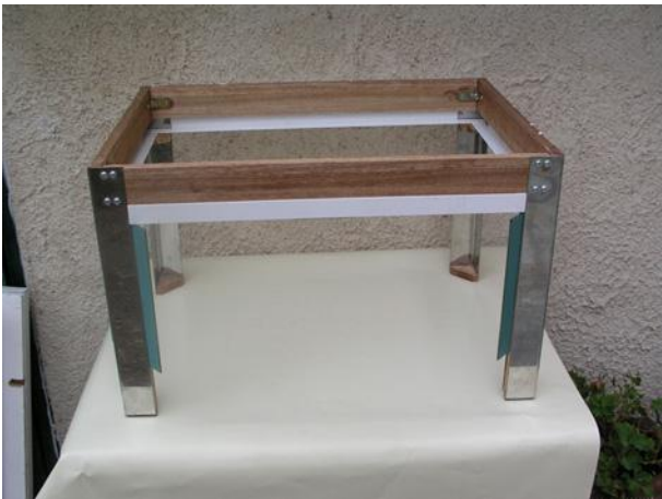
Light box support table