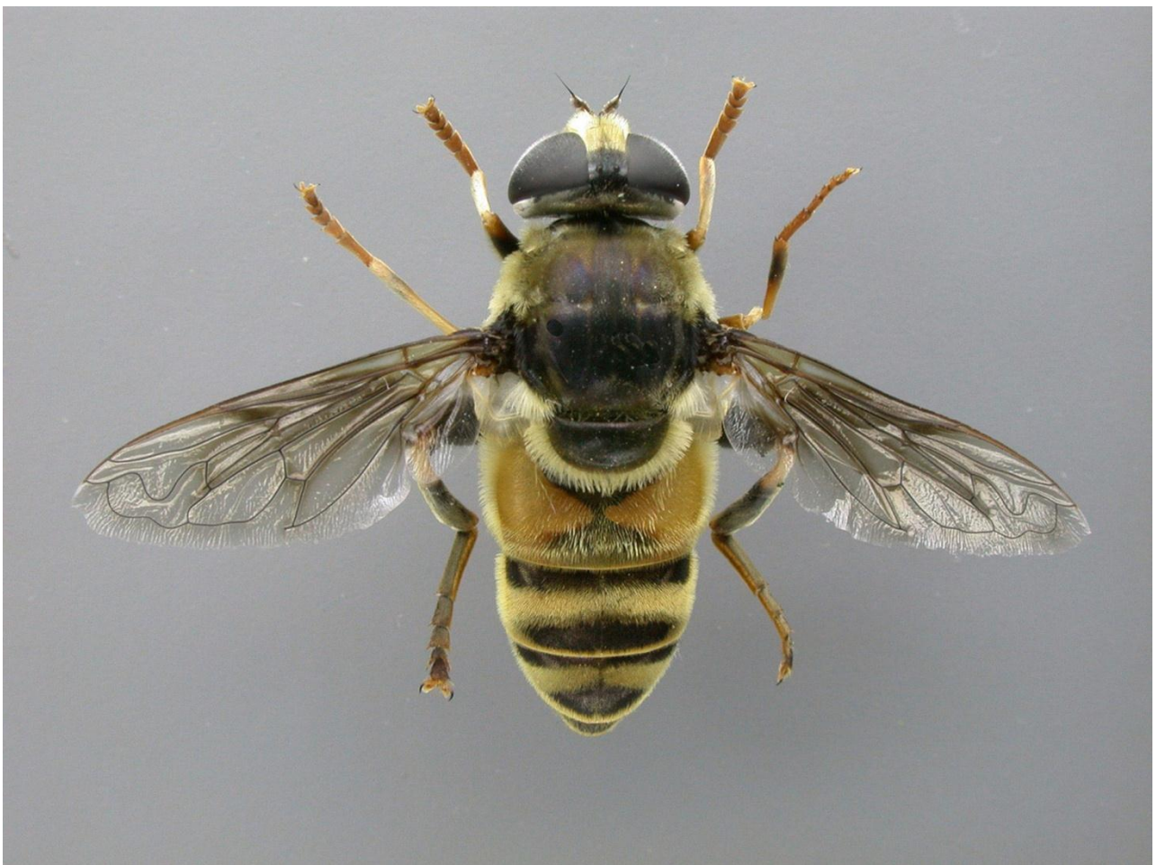
Fig 3. Female Merodon pruni .Rossi.1790.(Diptera, Syrphidae). Wingspan 31mm, Length 17mm.