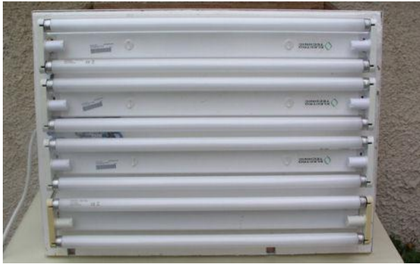
View of light box assembly