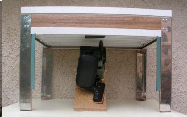
View of work station in operation, using An early camera/specimen stage prototype