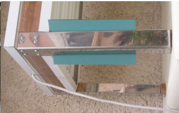
Front left mirror from front