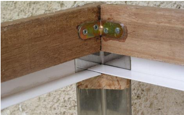
Detail of upper corner assembly