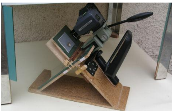
Camera on prototype stage with insect Specimen in position for photography