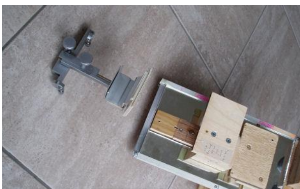
Detail of microscope attachment provision with microscope stage detached from saddle