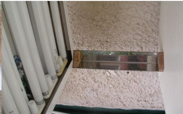
View of rear right leg and light tubes