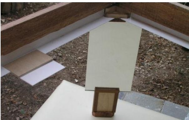
View from inside of front left mirror